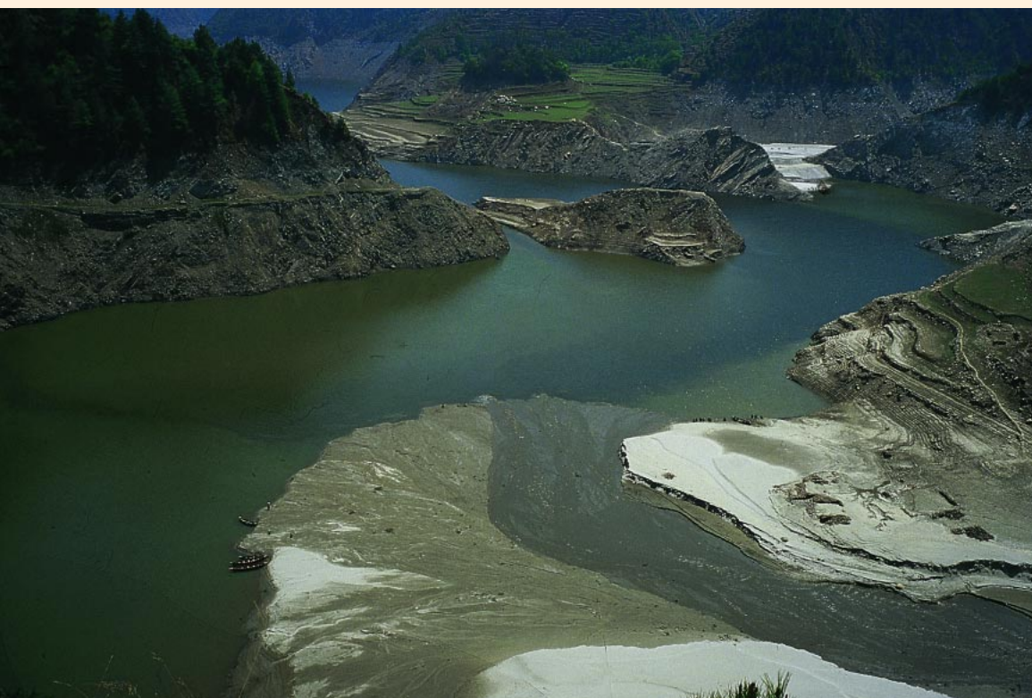
FIGURE 7 A single 30-hour stormburst in July 1993 scoured sediment off upstream mountainsides and deposited it in the Kulekhani reservoir, leading to a one-tenth reduction of dam storage capacity. Kulekhani had a predicted life of 75 to 100 years after completion in 1981, but sediments could put the dam out of operation long before that.

where water and hydroelectricity from a few large facilities provide the bulk of a country's export earnings. Resettlement to make way for large reservoirs is another major issue. There are many cases all over the world where this issue has been handled to the detriment of those resettled. Thanks to the global debate on the pros and cons of large-scale hydropower development, these problems are now more widely acknowledged than before among developers, donors, and the general public. Therefore, careful planning will be required for all export-oriented facilities.