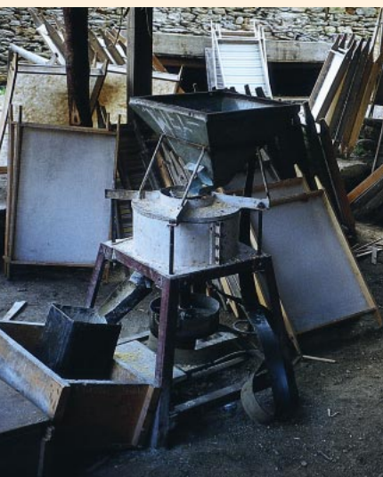
FIGURE 3 Paper production made possible by a micro-hydel in Loding at the head of the Solu Valley, Nepal.