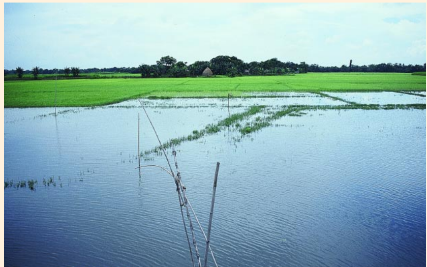
FIGURE 5 Flooded fields in the Brahmaputra/Jamuna flood plain in Bangladesh. Recent studies have shown that dams constructed in Nepal have little effect in preventing such floods.

also generate new markets for other electricity-generating utilities.