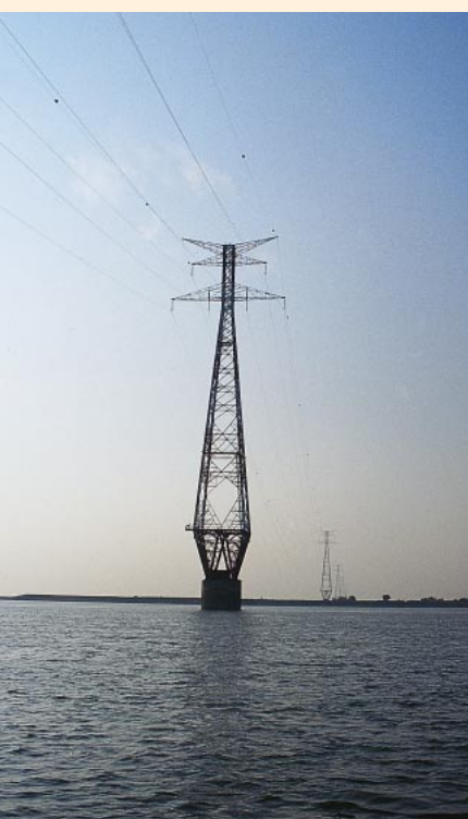
FIGURE 4 Electric power line crossing the Brahmaputra (Jamuna) River in Bangladesh. Such existing grids could be used to import hydropower from Nepal.

activity in rural areas, such as small-scale industry (Figure 3) and tourism. A hydropower project with a 100-kW capacity can potentially replace 100,000 L of kerosene annually if the electricity is used only for lighting. Inducing people to use electricity for cooking could reduce fuelwood consumption, and an additional effect would be gained from reducing smoke-related health problems. Due to small plant size, community participation in design and implementation is easier than with larger facilities and environmental aspects can more easily be incorporated. Guaranteeing sufficient low flow in the watercourse for downstream use and preserving resources such as fish are major concerns.