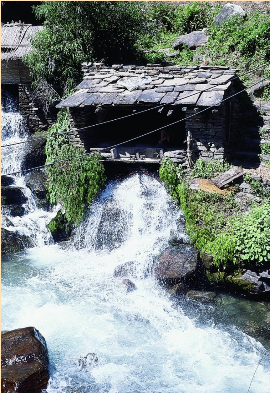
FIGURE 1 Nepal's rich mountain water resources make small hydels of this sort possible. Such plants are used to produce power in remote valleys for small-scale industry.

Nepal might be able to control forest degradation by adopting a differentiated approach to hydropower development. The prospects and the risks of such development are discussed here, and three scenarios that have received increasing attention in recent years are presented for implementation in a wider South Asian context.