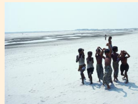
FIGURE 6 Very low discharge of the Brahmaputra/Jamuna River in the dry season leaves one channel of this mighty river almost entirely dry. It is hoped that dammed water resources in Nepal could supplement the periodically low water supplies in Bangladesh.

Water is an important issue in Bangladesh. More than 20% of Bangladesh is flooded in the monsoon season (Figure 5), although this figure varies extensively from year to year (eg, from 0.3% in 1994 to 67% in 1998). This widespread flooding is a recurrent problem for economic development, including food security. Water is often scarce in the dry season (Figure 6). Therefore, Bangladesh is interested in plans to construct high dams in Nepal to contain monsoon flow and increase dry-season discharge in the Ganges. However, recent research strongly suggests that Bangladeshi floods do not originate in the Himalayas but are the result of heavy rainfall within Bangladesh and neighboring areas in India and that dry-season discharge will not increase sub-